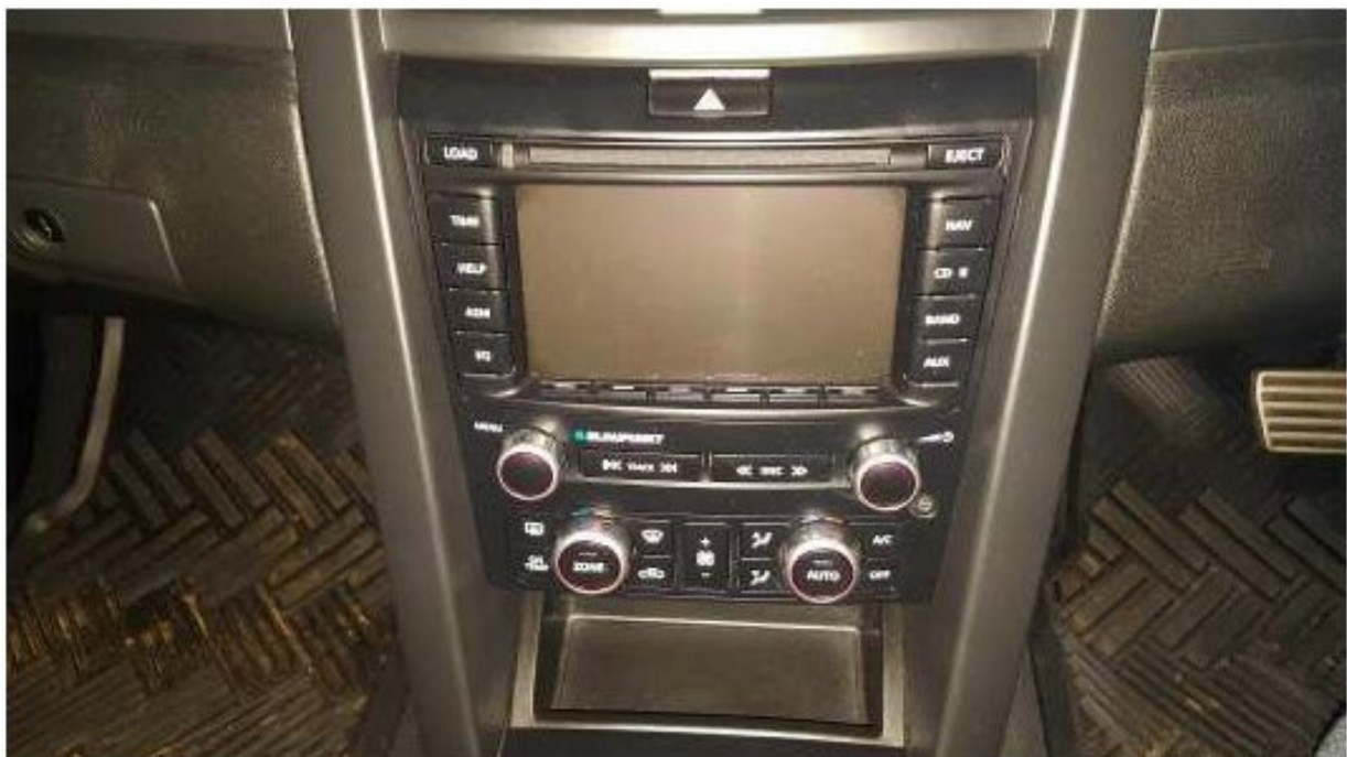
This is the factory installed radio.