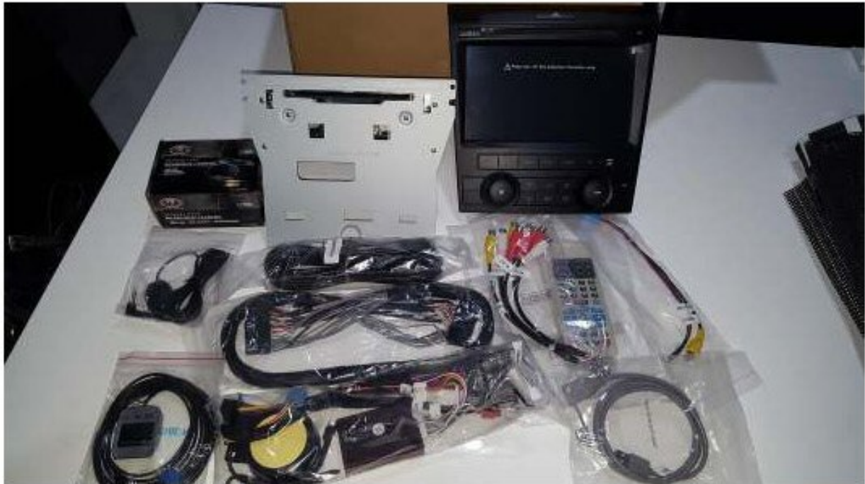
This is the kit.